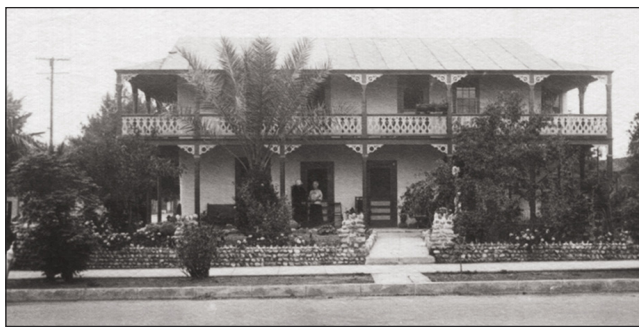
Casa de López circa 1935